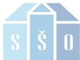
Srednja škola Oroslavje Croatia